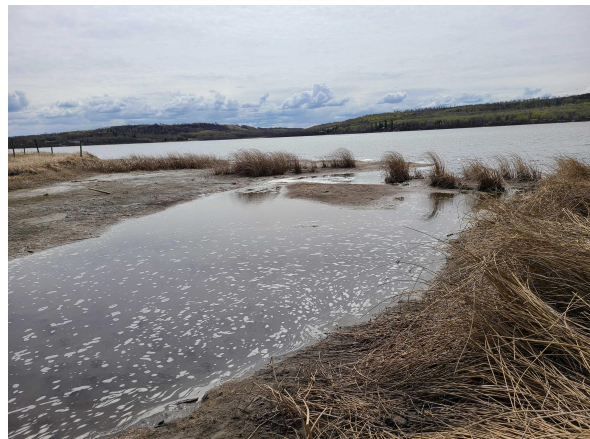
Figure 1b. Waspasu Lake outlet. Photo taken May 10, 2022.