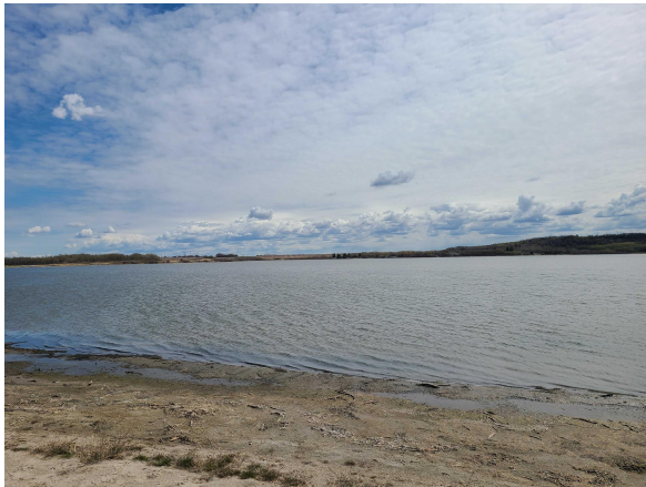
Figure 1a. Waspasu Lake. Photo taken May 10, 2022.

This report will cover the findings and results from Waspasu Lake and make a preliminary proposal with rough budgets, based on our knowledge and experience in aeration and pond technology.