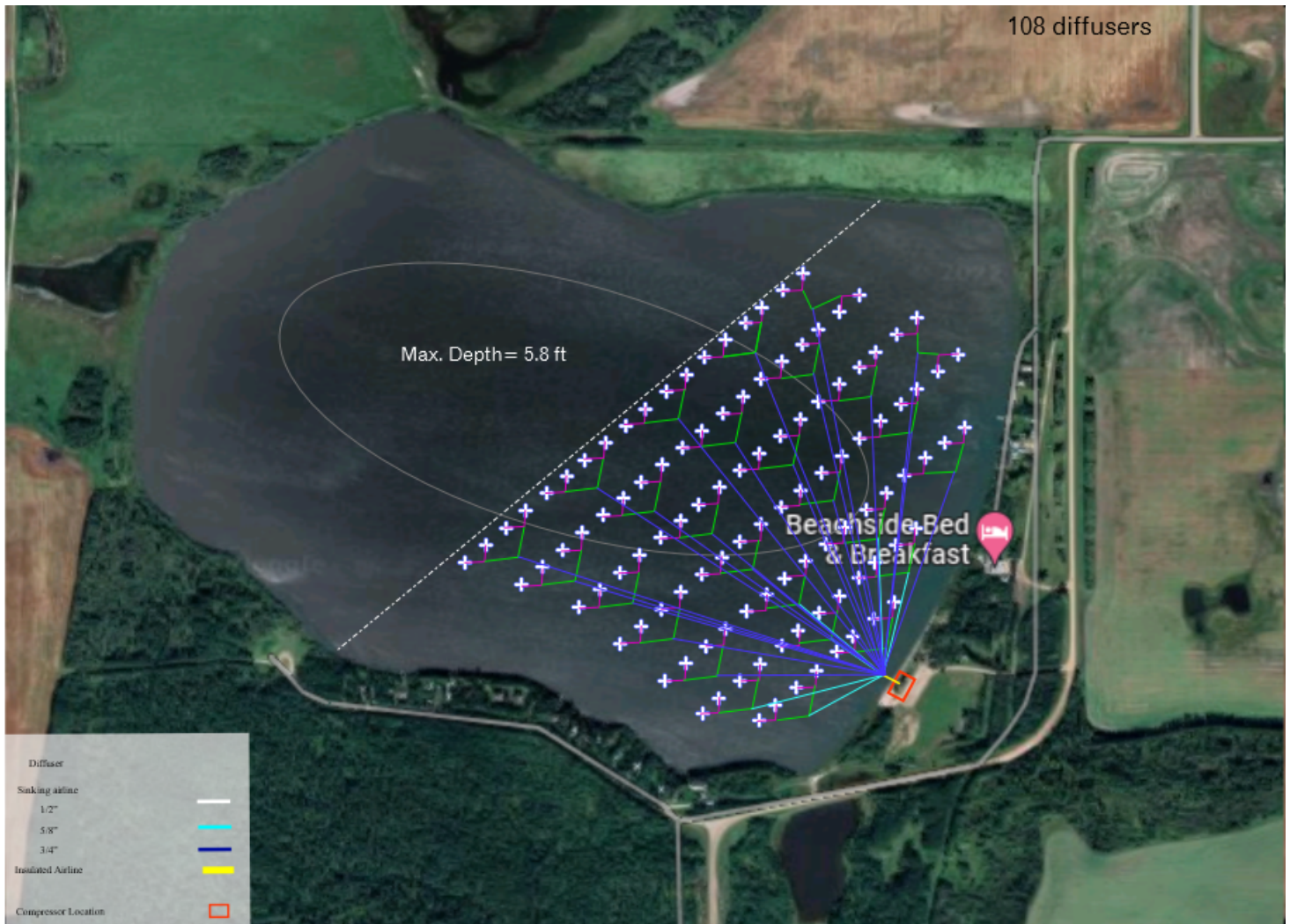
Figure 2. Pond Pro's recommend diffuser layout design.