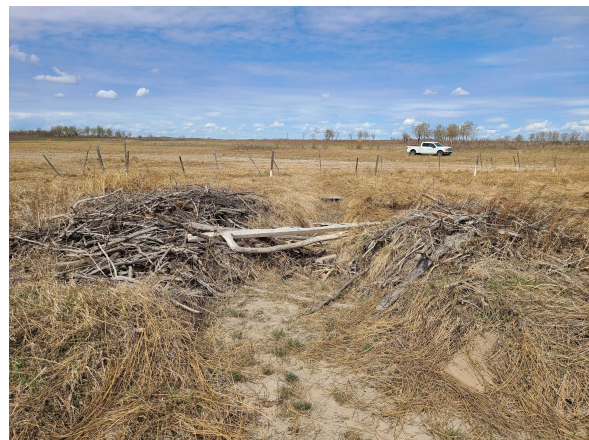
Figure 3b. Possible lake over flow