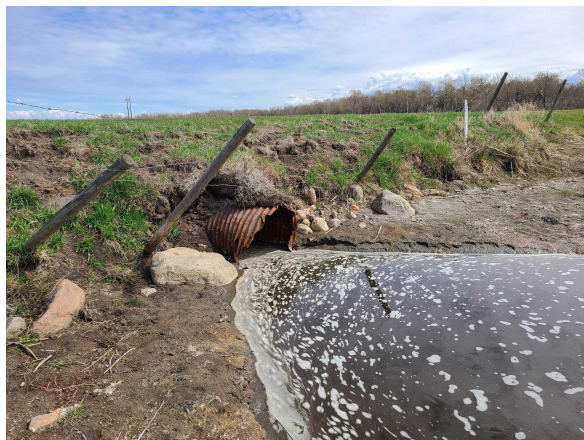
Figure 3a. Lake outlet.

Alum treatment will only be effective by eliminating external phosphorus sources. Prior to performing the alum treatment, the culvert on the north side of the lake must be raised to eliminate overflow from the wetland into the lake (Fig 3a.). By raising the culvert by about 2 feet it will increase the depth of Wapasu Lake, making aeration more efficient in the future.